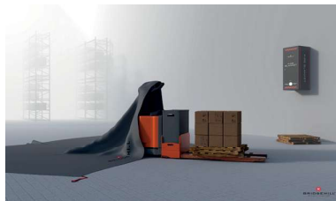
Pallet truck: ± 5 × 5 m