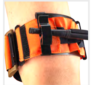
Keep tourniquet in place until emergency services arrive.