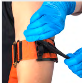
Apply tourniquet above the injured area.

This bright orange model stands out in any trauma kit, making it easy to locate under stress. Built for real-world emergencies, it combines simplicity, security, and effectiveness – helping you take control when it matters most.