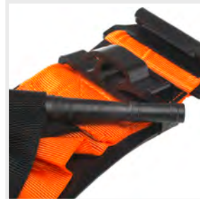
Twist windlass and secure under locking hook.